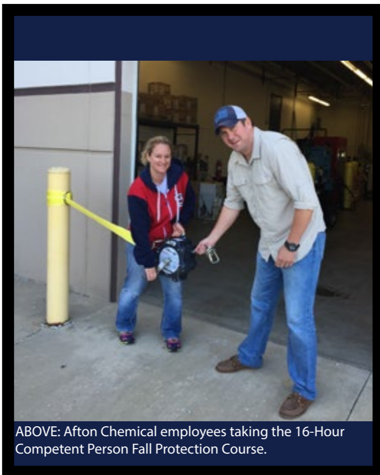
ABOVE: Afton Chemical employees taking the 16-Hour Competent Person Fall Protection Course.